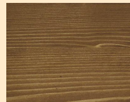
Bangkirai No. 110-85