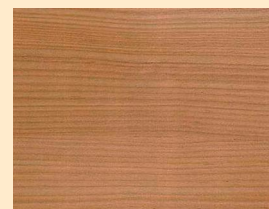
Larch No. 110-89