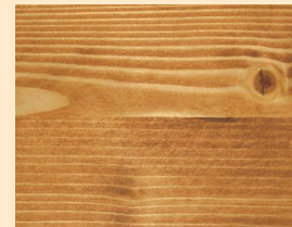
Teak No. 110-81